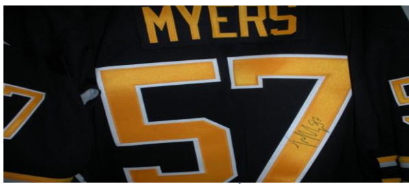
#1 Myers Autographed 3 rd Jersey #2 Connolly Autographed Jersey