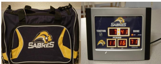
#6 Sabres Gym Bag #7 Scoreboard Alarm Clock